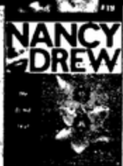
The Orchid Thief