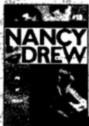
Pit of Vipers

Have you solved all of Nancy's latest cases?