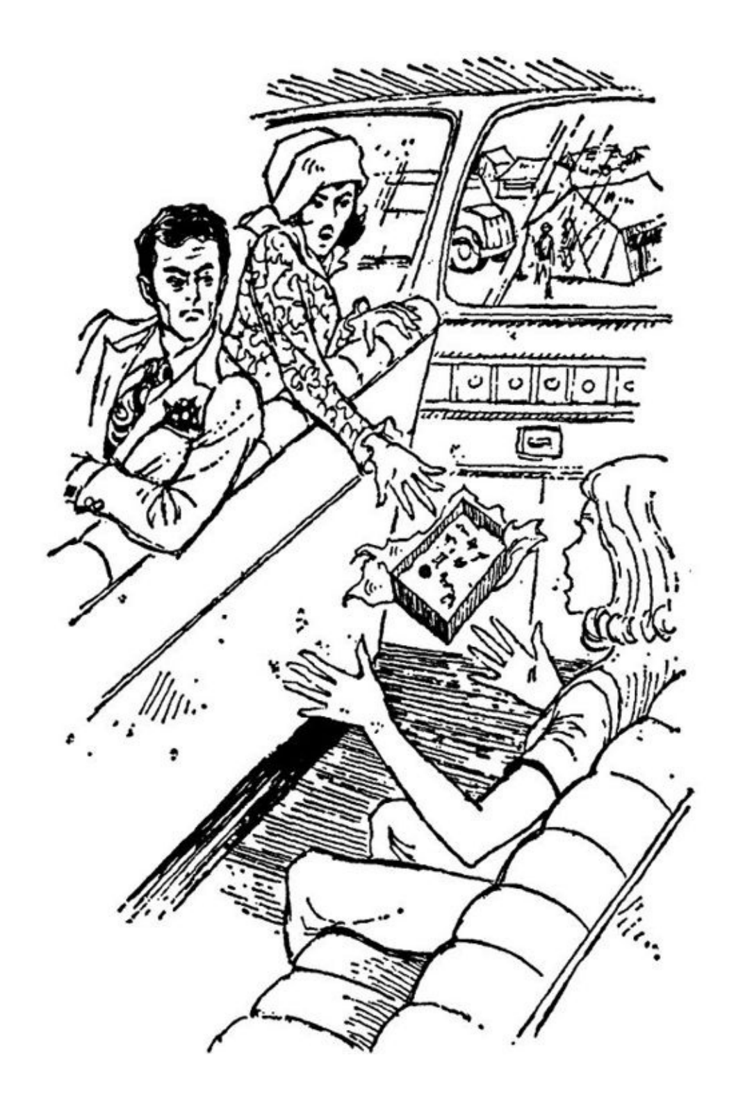
"We've bought stolen property!" the woman shrieked.