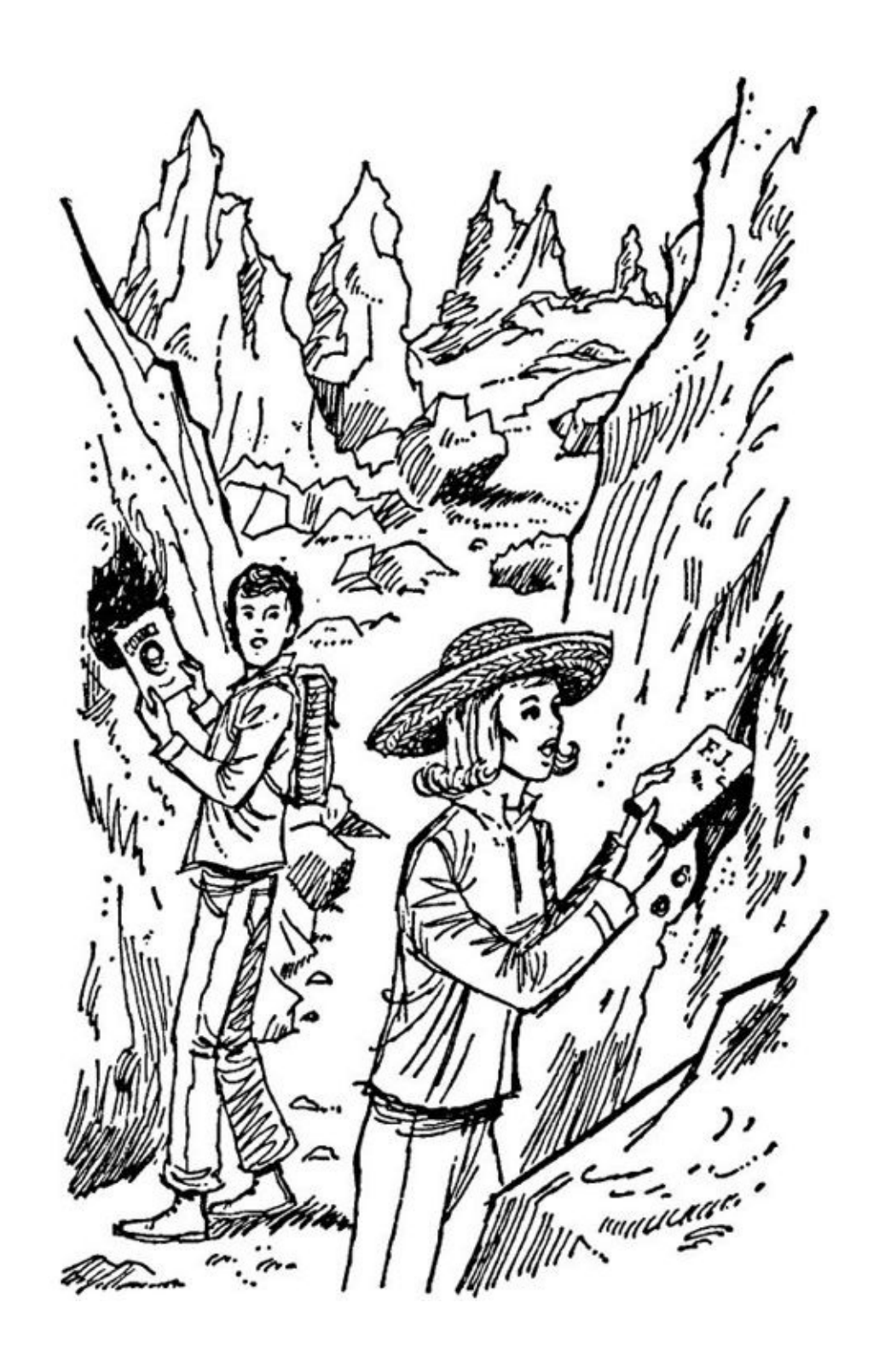
"Fleetfoot Joe's initials!" Nancy exclaimed.

The flat object, wrapped in a cellophane bag, had been wedged between two rocks and covered with sandstone scrapings.