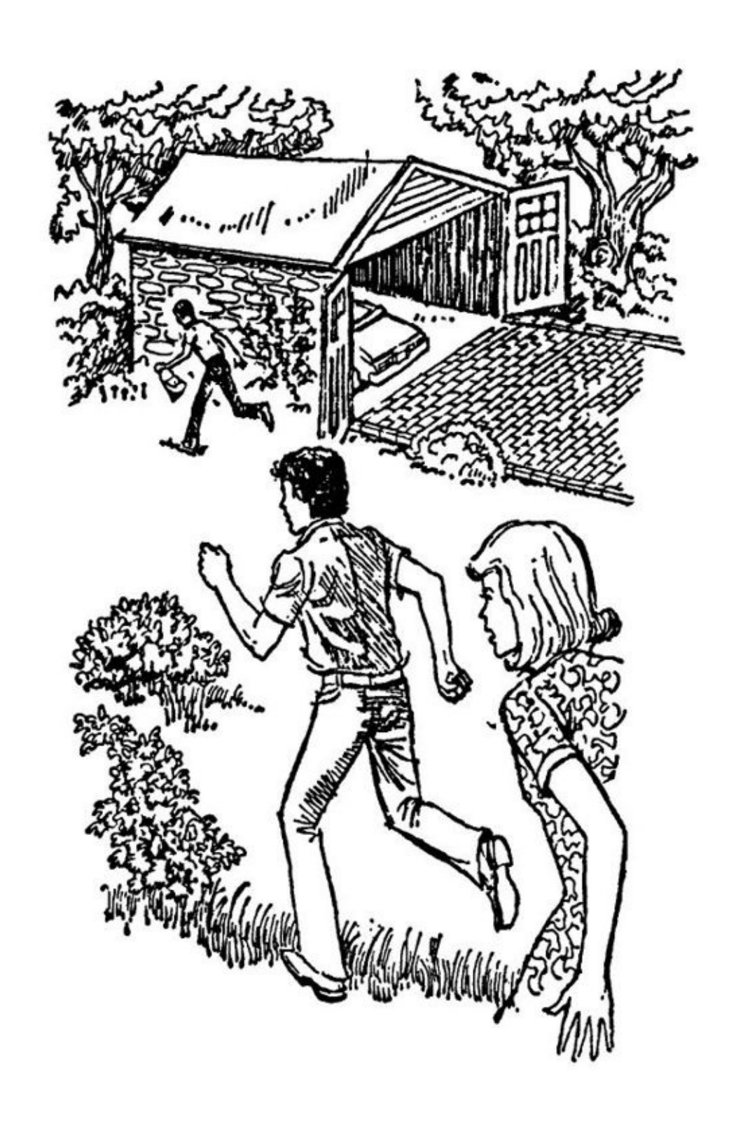
A woman's large handbag swung from the thief's hand.